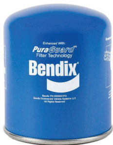
41 mm Oil Coalescing Cartridge