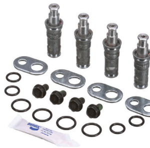
Cartridge Pressure Protection Valve Kit