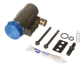
D-2® Governor Kit