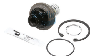
Purge Valve Kit